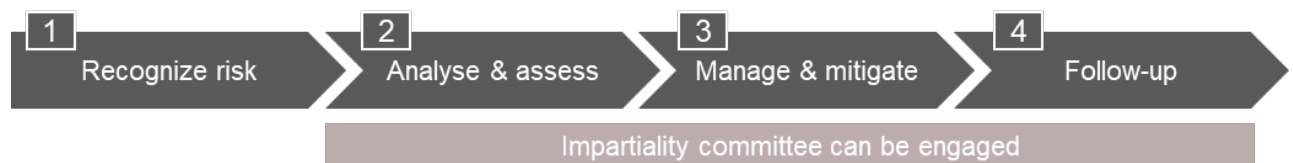
Figure 4. Required steps to handle an impartiality risk.

The process describes how RICERT works with impartiality risks and how the Impartiality committee can be engaged if required. It consists of four main steps, described below.