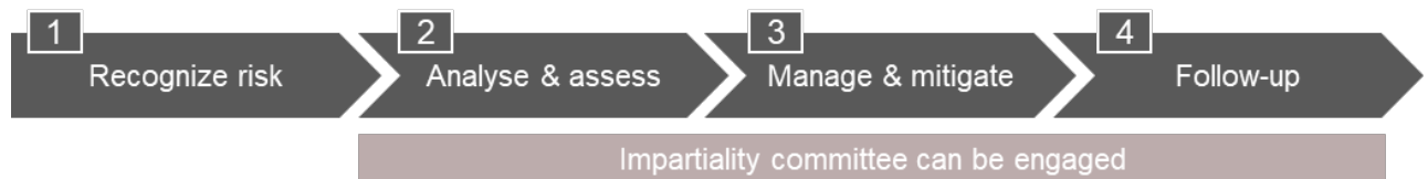
Figure 4. Required steps to handle an impartiality risk.

The process describes how RICERT works with impartiality risks and how the Impartiality committee can be engaged if required. It consists of four main steps, described below.