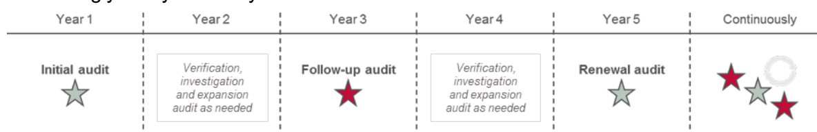
Figure 2. Audit cycle

Figure 2 presents the audit cycle consisting of the initial audit that is the starting point of the cycle and is continuously followed by a follow-up audit and renewal audit performed alternately every second year.